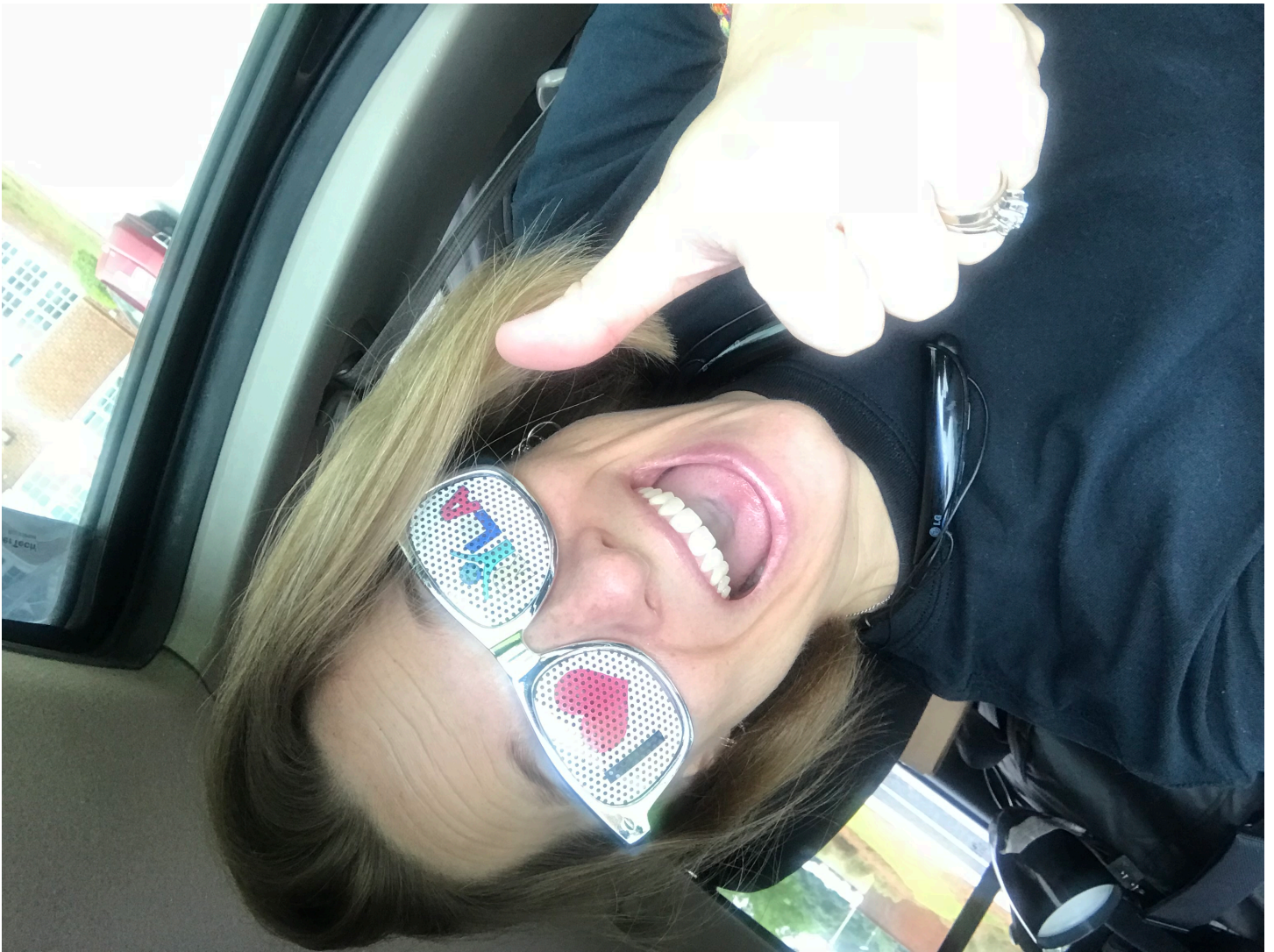
Posted by Jaclyn Donovan June 3, 2024