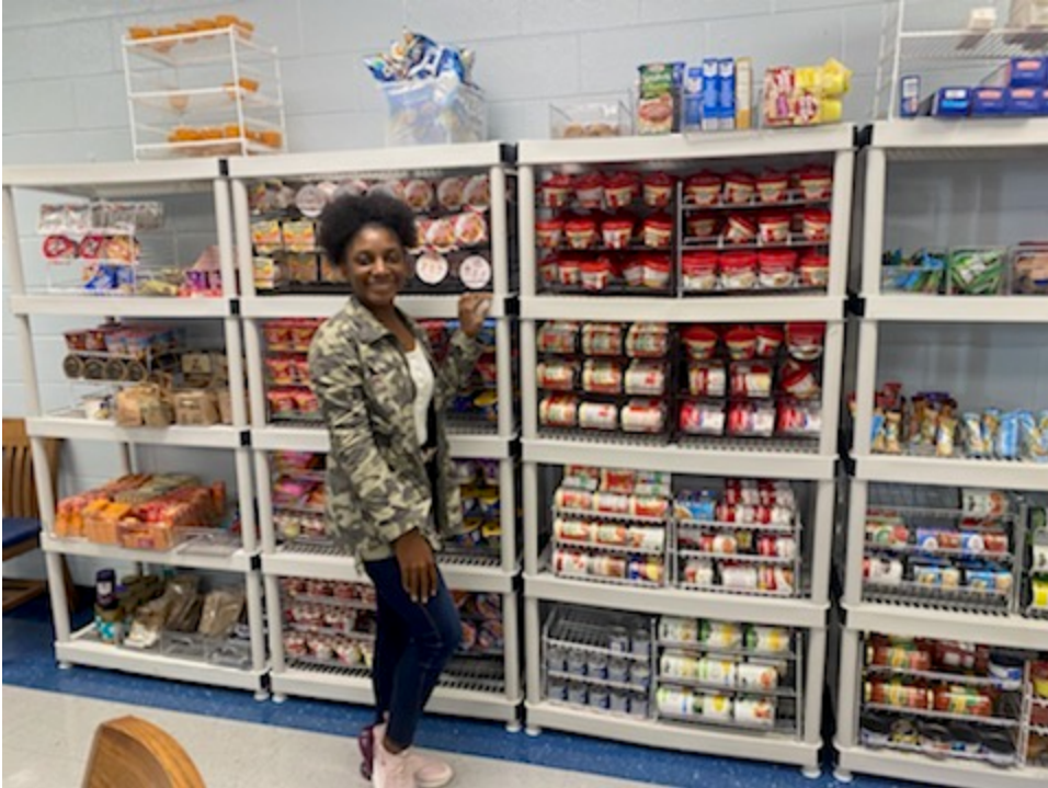
Posted by Laurie Lewis December 3, 2021