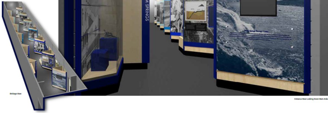
WARM SPRINGS Entrance - Concept