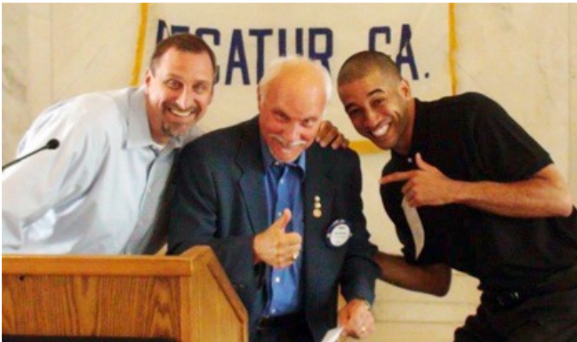
Boys and Girls Club grant recipients with Decatur Rotary's Community Grants Chair