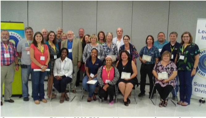
Our most recent District 6900 RLI participants ... students and trainers all learn through their RLI experience.