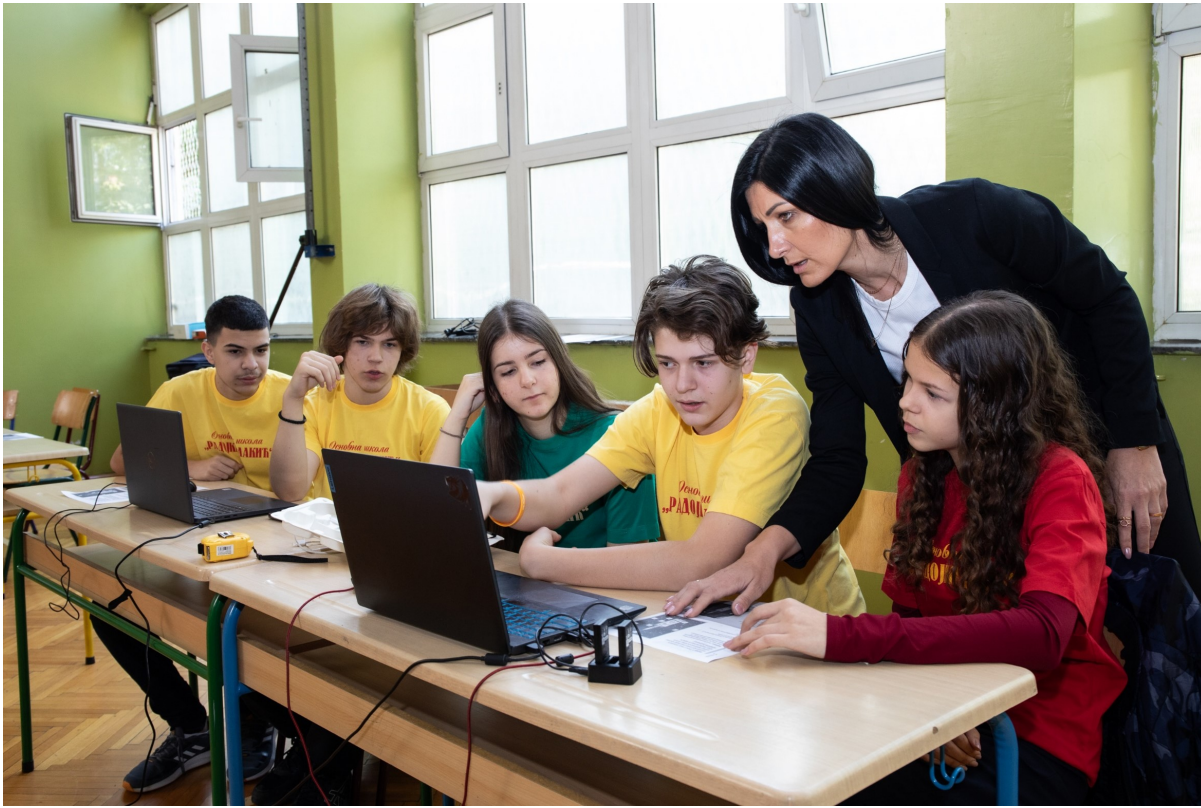
actual students benefiting from the “mBots Robots for Primary Schools” project, funded by the Foundation, Districts in Serbia, US, USAID