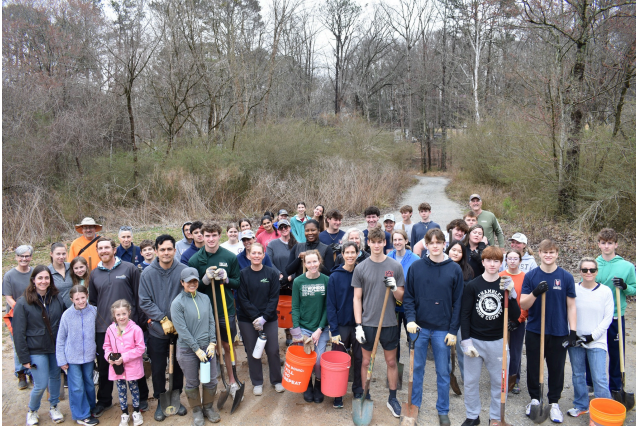
Brookhaven Rotarians joined other community groups for February's Arbor Day tree planting event cohosted by the Murphey Candler Park Conservancy and Brookhaven's Tree Canopy Preservation team