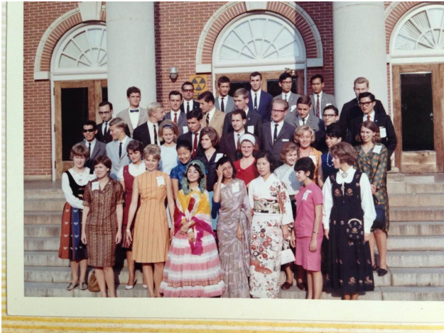
Vintage throwback photo: GRSP Class of 1965-66 at the GRSP Conclave in 1965