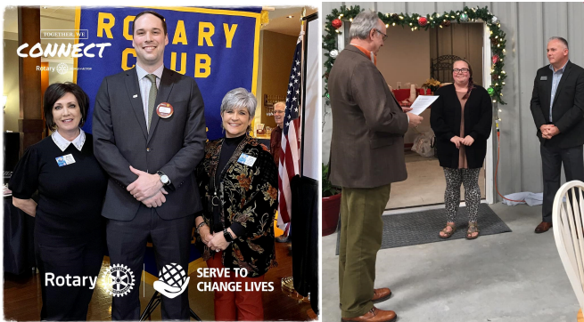
New members from Peachtree City and Polk County

Take this Learning Center course to help draw prospective members, update your club's experience, and better highlight what it does well. [more]