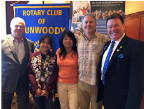
Visit us @rye6900 f t