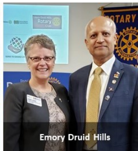
Emory Druid Hills