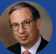
Carlos del Rio