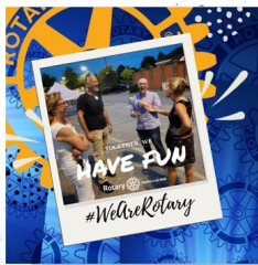
North Cobb held a very special fundraising event benefiting CCYA - who provides food, shelter, clothing and supervision for children in need