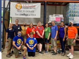
Peachtree City packed over 800 bags of canned goods to be distributed to more than 300 agencies