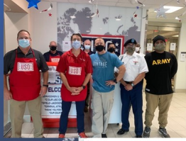
Alpharetta "celebrated new soldiers" at the USO