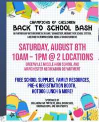
Meriwether County supports Back to School Bash