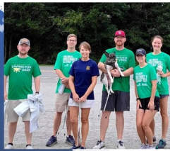
Carrolton Dawnbreakers join Great Carrolton Greenbelt Cleanup!