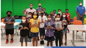
Columbus Rotary and Greater Columbus Rotaract donate 150 earphones with microphones to assist with distraction free virtual learning (thanks Joe Young)