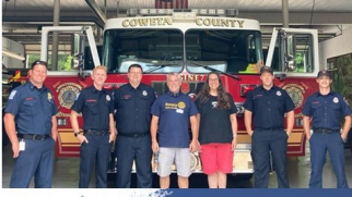
Senola proudly hosted a first responder & veteran appreciation lunch