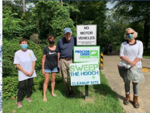
North Atlanta recently joined "Sweep the Hoop" - No trash Saturday" at the Proctor Creek site