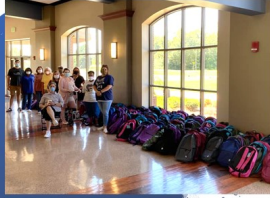
Barnesville helping fill school bags