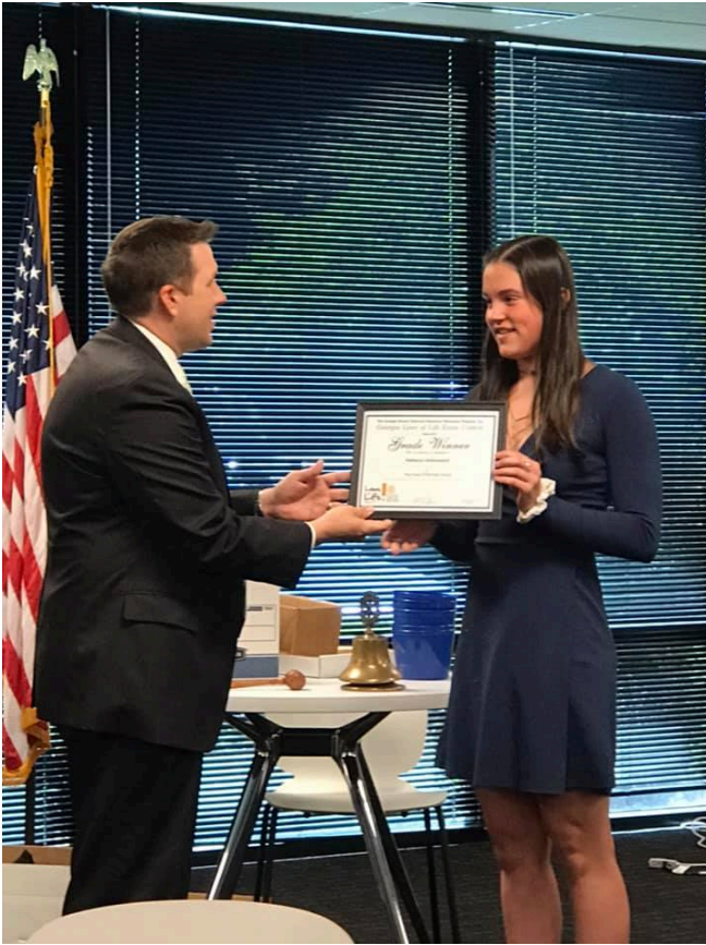
At Paul Duke STEM High School in Gwinnett County, participation in the Georgia Rotary Clubs sponsored Laws of Life Essay Contest soared from 12 students last year to 718 students for the 2019-2020 contest.