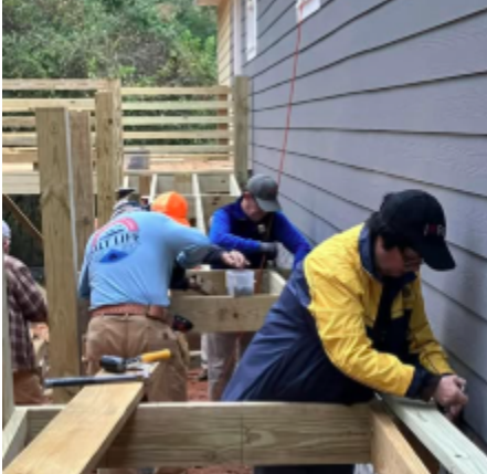
The Rotary Club of Griffin has utilized a Rotary District Competitive Grant to construct a few