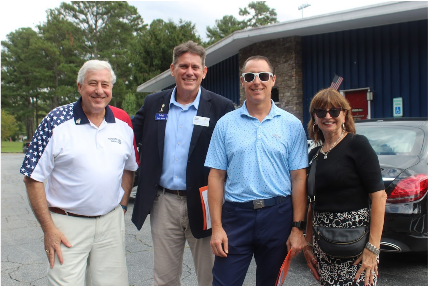
Posted by Kathryn Igou October 2, 2024