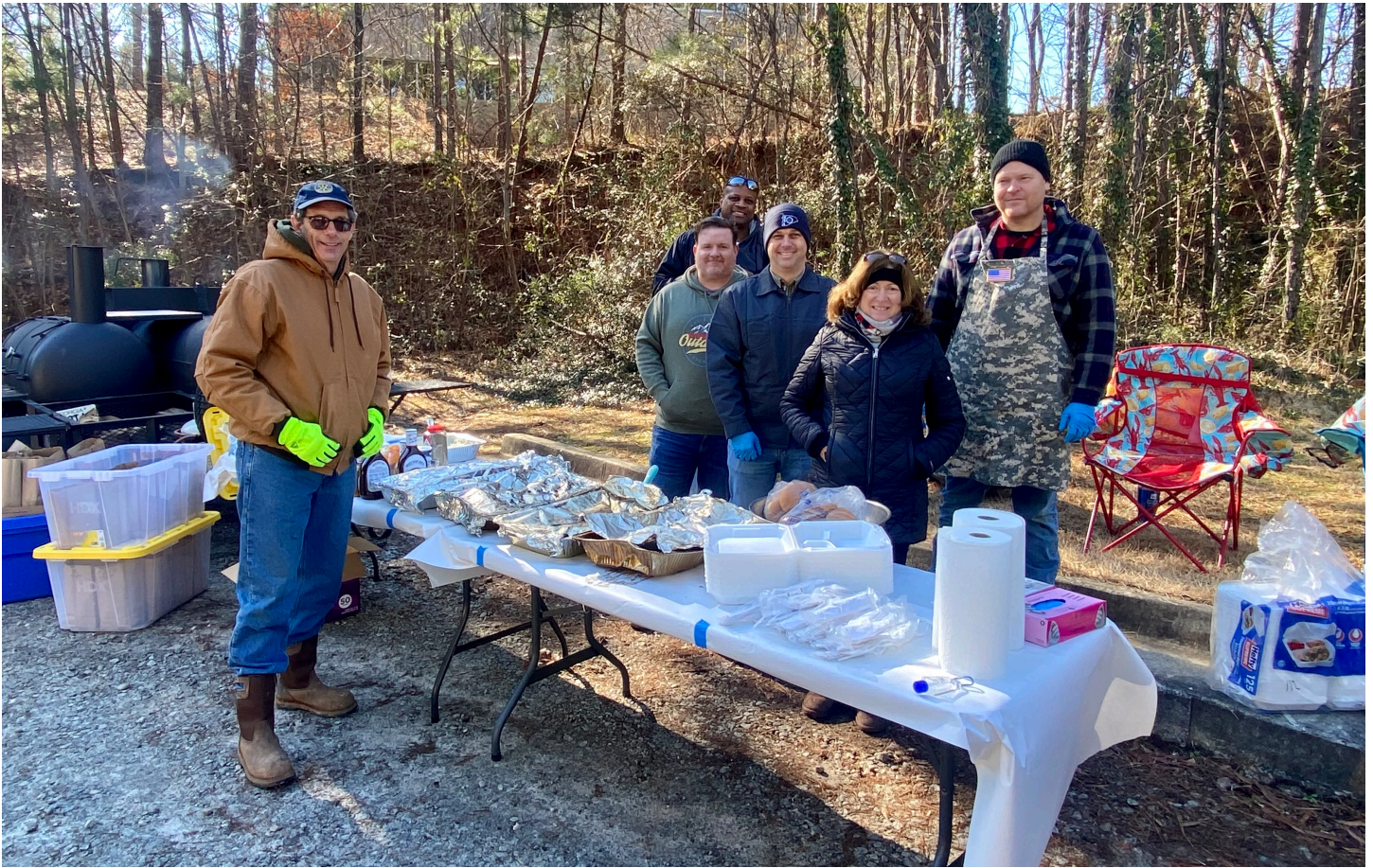
Posted by Nell Boggs March 27, 2023