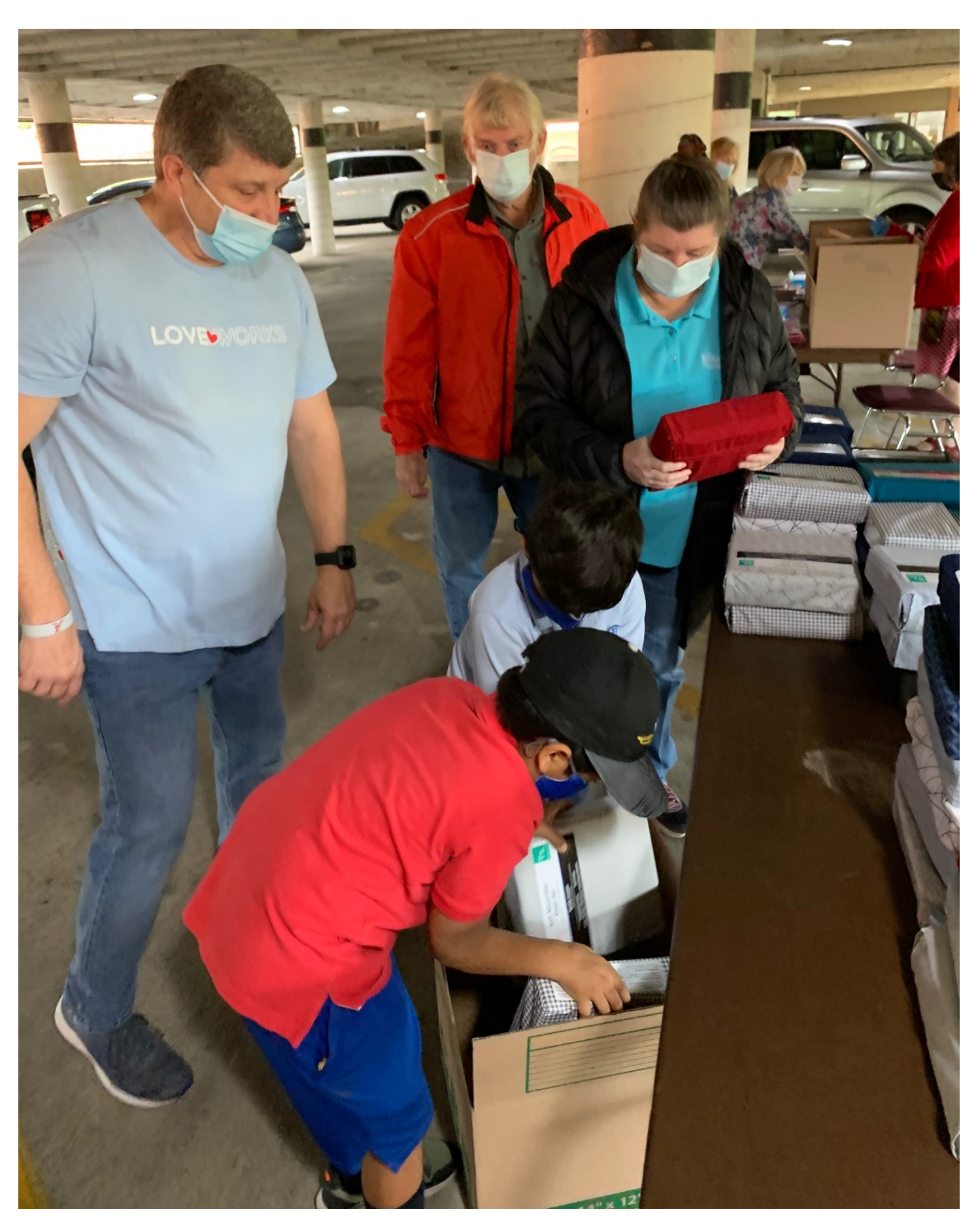
In September, Rotarians from Columbus, North Columbus, Muscogee and Rotaract Clubs met enthusiastically and safely at the Trade Center Parking garage, to carry out our collaborative club service