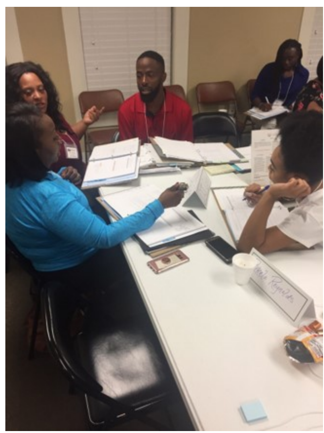
Posted by Carol Jones December 3, 2020