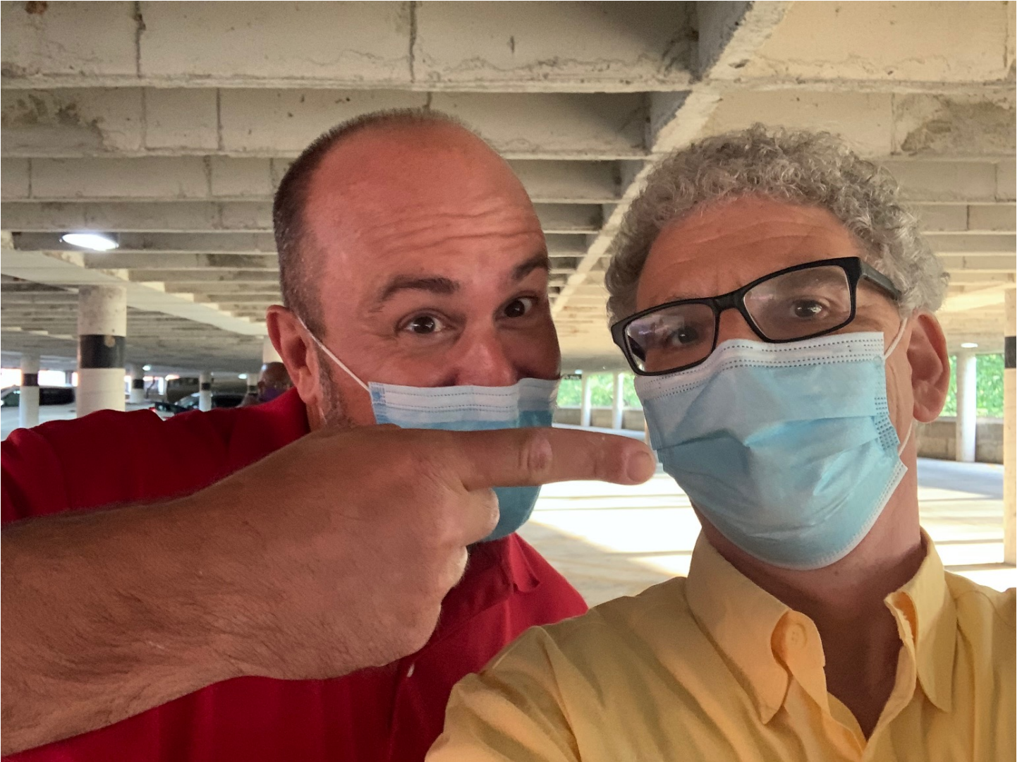
Posted by Ian Bond November 8, 2020